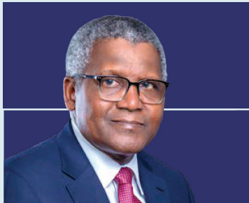
Alhaji Aliko Dangote, GCON

During the financial year, Alhaji Aliko Dangote, GCON, the pioneer Chairman of Dangote Cement Plc, retired from the Board. His retirement marks a significant milestone in the Company's history, given his pivotal role in its establishment, growth, and transformation into Africa's leading cement manufacturer.